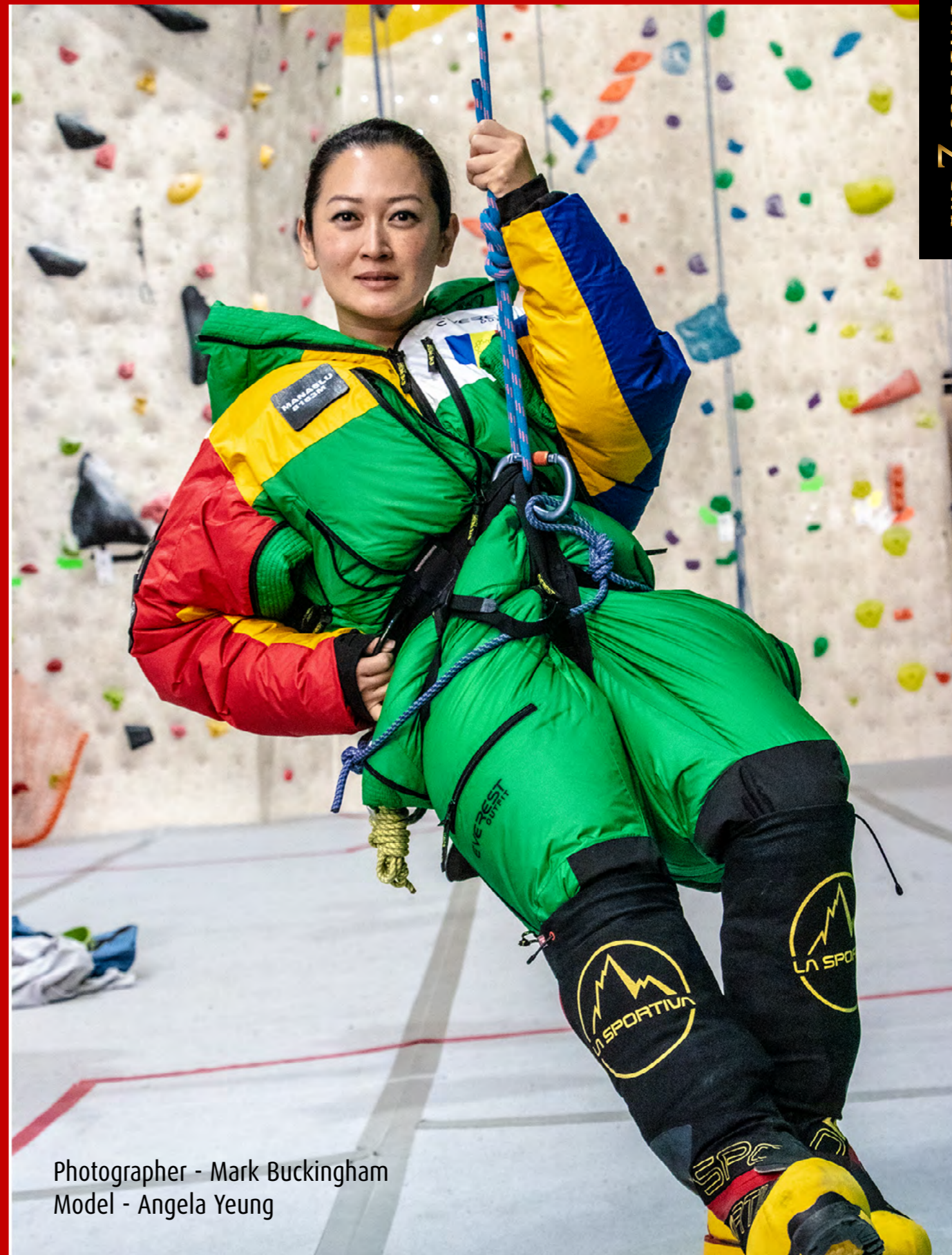
Model - Angela Yeung