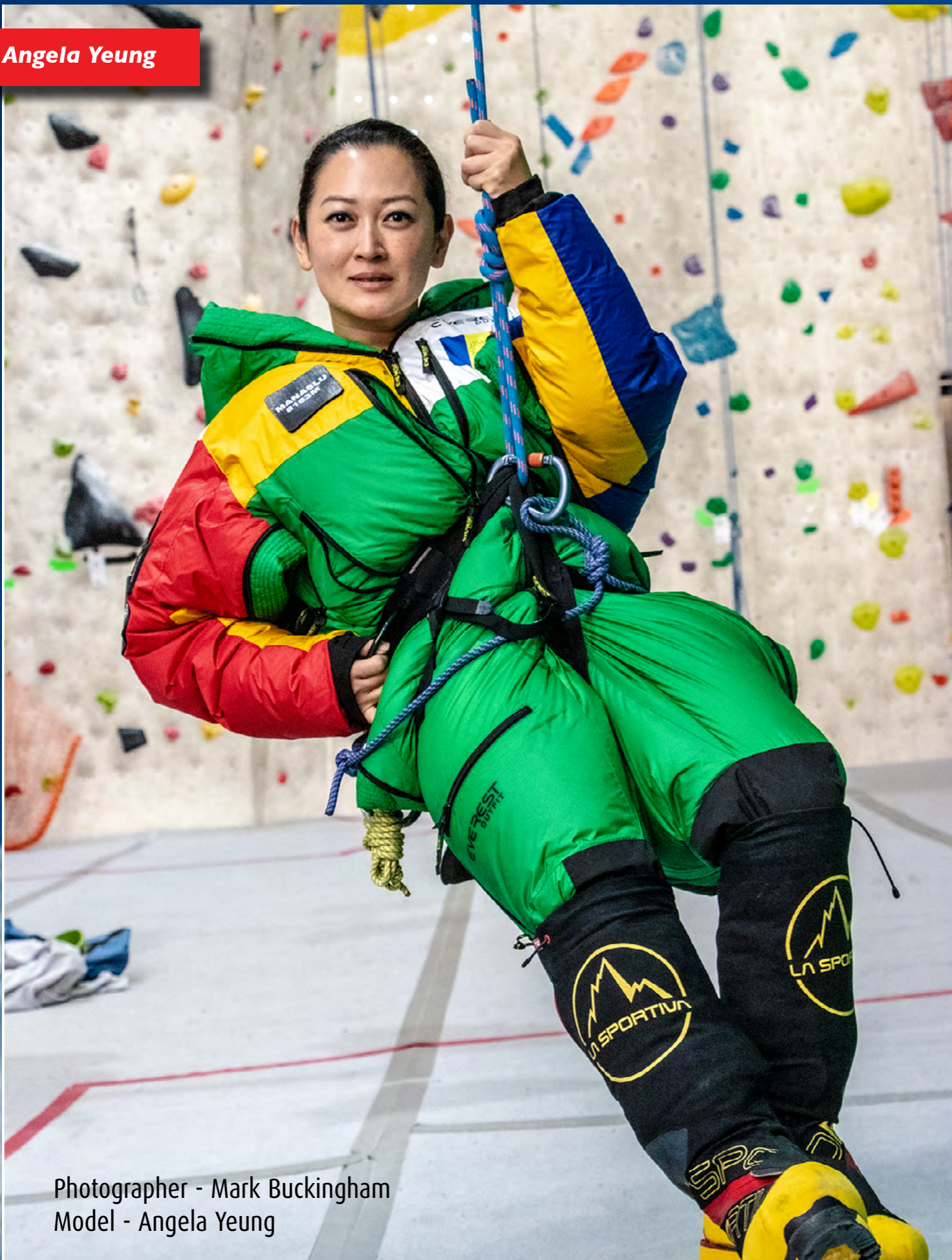
Model - Angela Yeung