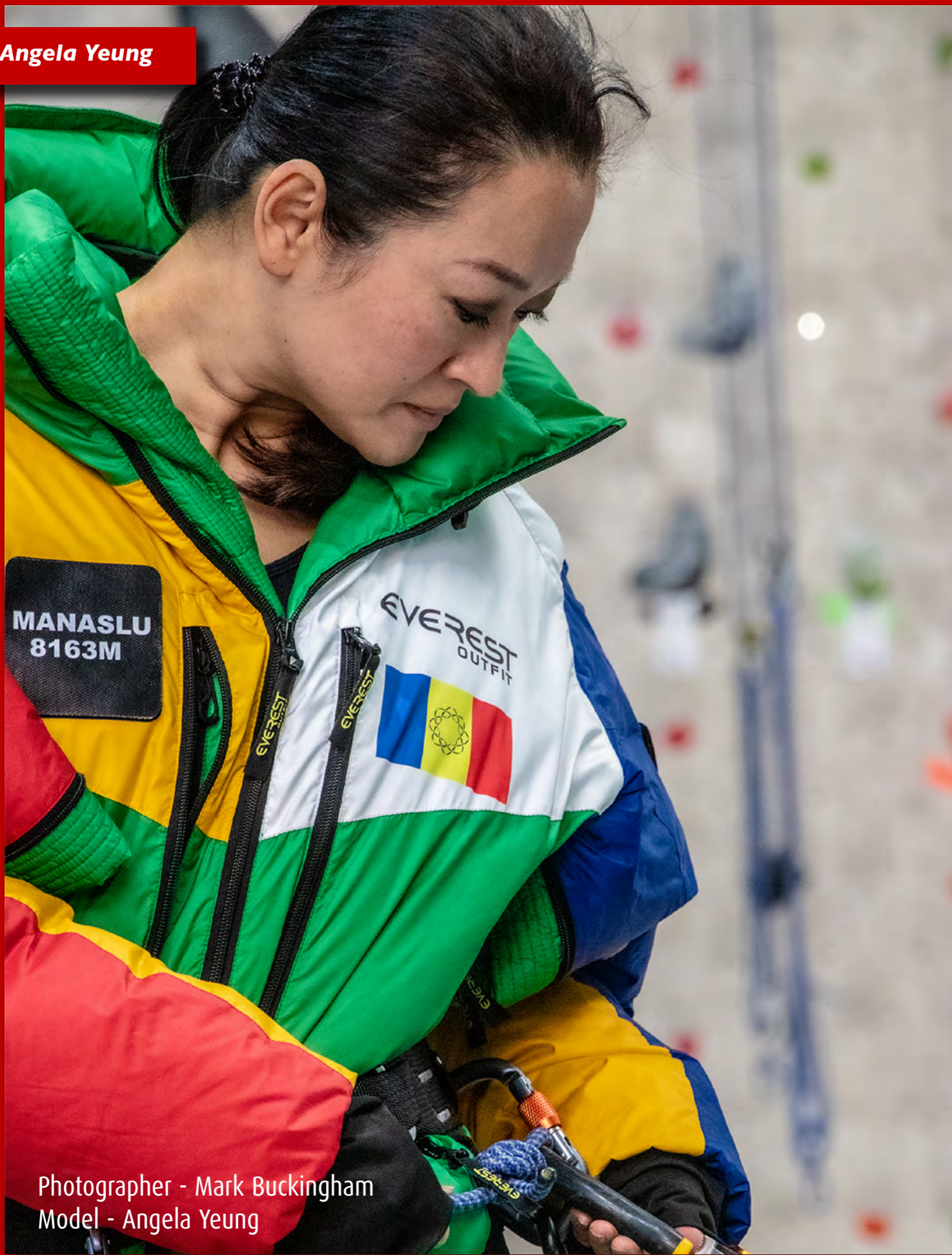
Model - Angela Yeung