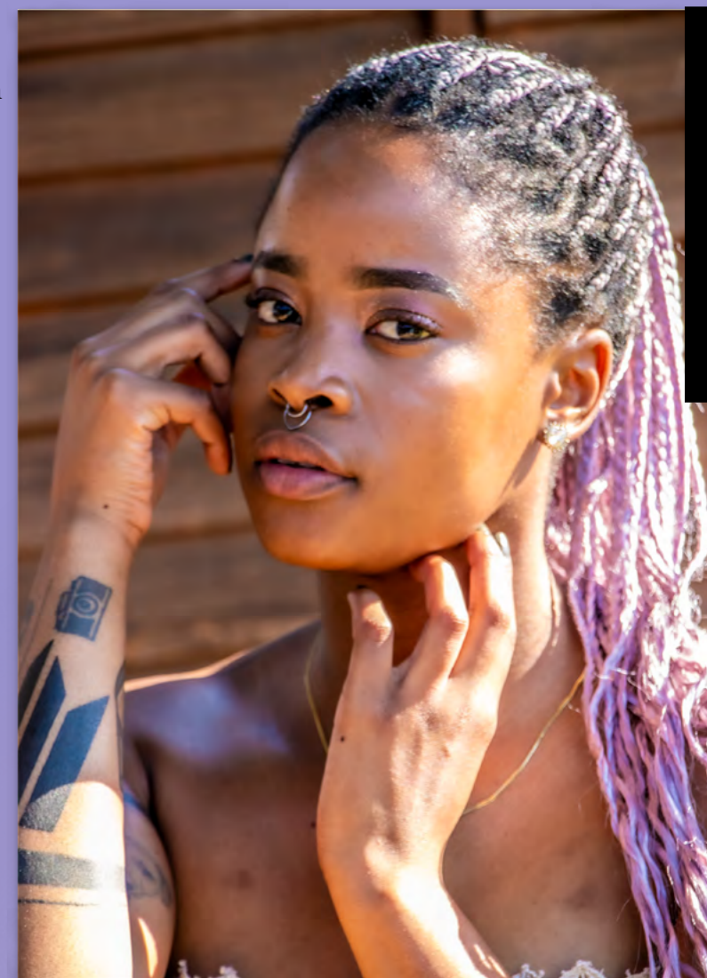
THE Z. CREATIVE