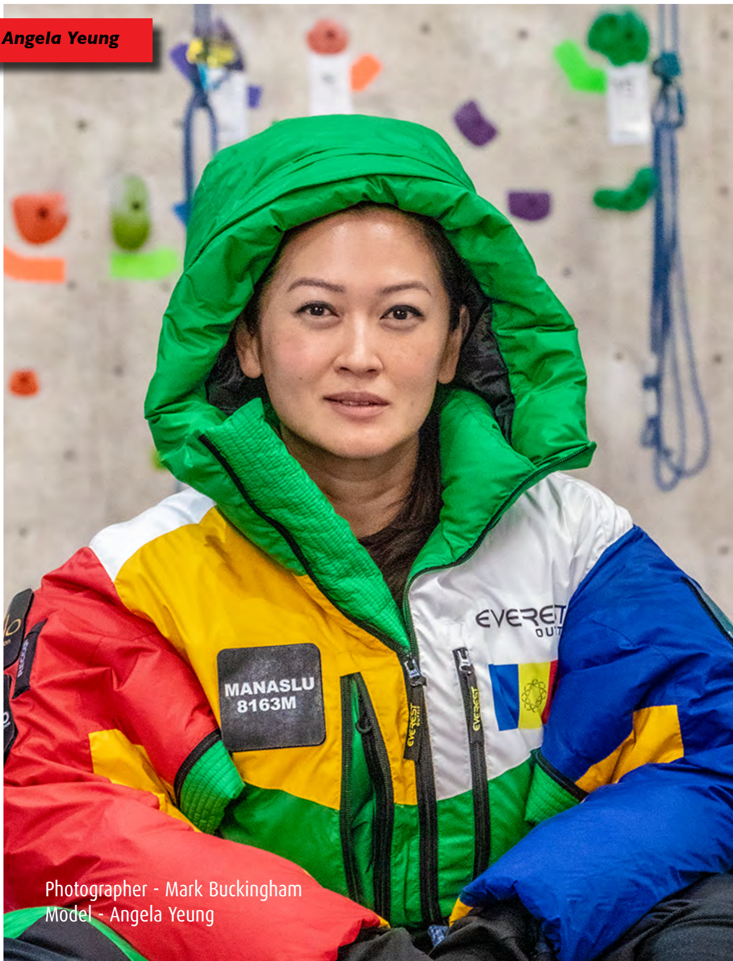
Model - Angela Yeung