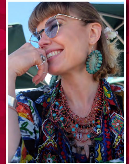
Bianka Hartenstein Lead Photographer